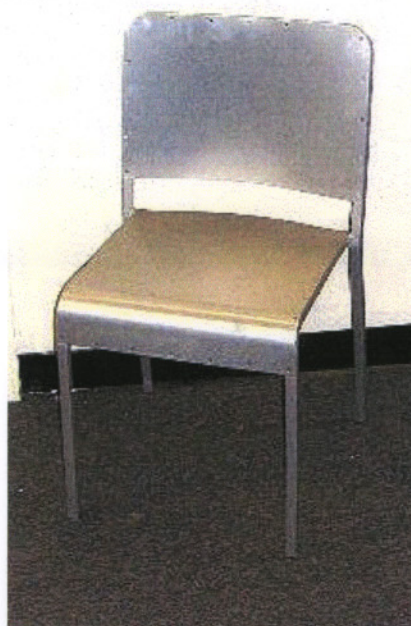
SIDE CHAIR, MODEL EMECO 2006

This report serves to document the testing of the above sample chair frame to all applicable test paragraphs of ANSI/BIFMA X5.1-2002, tests for general-purpose office chairs. Testing for complete certification was performed for this type of chair, classified by the standard's definitions as a Type III, fixed-seat, fixed-back chair. The remainder of this report will show how the chair submitted for testing met the requirements needed for conformance to the standard.